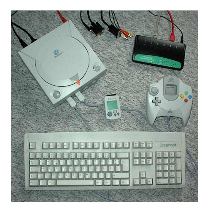
SEGA Dreamcast gaming console.

First, the hardware architecture is a non-x86 computer system, so the attraction for getting in contact with a foreign platform is one reason. Next, I want to know, how to setup and use cross compilers . If you have a running cross compiler, you're on a very shiny way - but, cross compiler raise (other) problems you won't probably have if you are just trying to compile your favorite program which was normally designed for an x86 platform. Last but not least, I haven't found any articles describing these steps I've shortly explained above, so, I want to be the first :-)